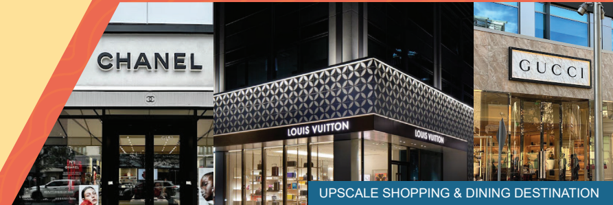
UPSCALE SHOPPING & DINING DESTINATION

PLANO IS RECOGNIZED AS ONE OF THE SAFEST CITIES IN THE U.S.