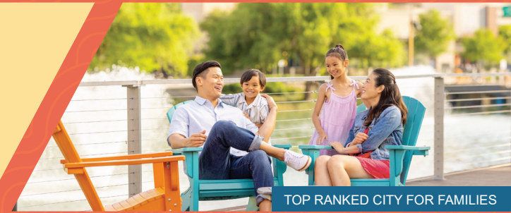
TOP RANKED CITY FOR FAMILIES

#3 TOP U.S. CITIES FOR INTERNATIONAL BUSINESS — FINANCIAL TIMES AND NIKKEI