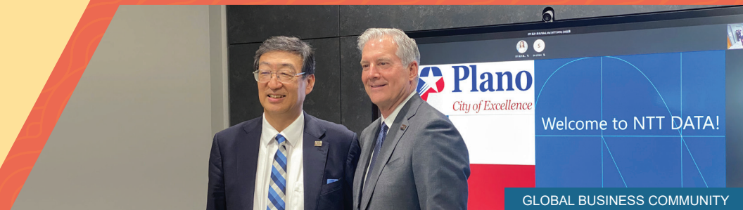
GLOBAL BUSINESS COMMUNITY